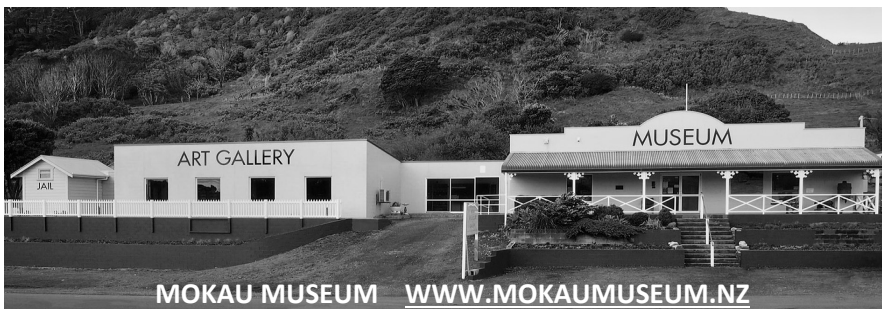
MOKAU MUSEUM WWW.MOKAUMUSEUM.NZ

THE MUSEUM IS OPEN FROM 10 TO 4PM 7 DAYS A WEEK. ENTRY IS BY DONATION